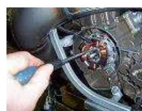
UNTIGHT THE 3 CROSS HEAD SCREWS WITH AN IMPACT SCREW DRIVER.