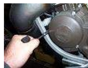
REMOVE THE IGNITION COVER USING AN 8MM WRENCH.