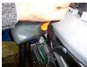
UNMOUNT THE ORIGINAL HV COIL.