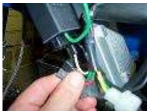
REMOVE THE ORIGINAL HV WIRE FROM HV COIL AND DISCONNECT THE SOCKET.