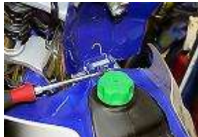
REMOVE THE COVER MOUNTING BOLT.