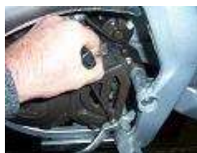
REMOVE THE GEAR SELECTOR USING A 10MM WRENCH.