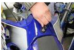
OPEN THE GASOLINE COVER.

Ignition timing for crankshafts with a stroke higher than 40mm or a cylinder bore higher than 50cc is 0,35mm before TDC.