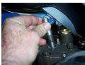
INSERT A PISTON STOP INSTEAD OF THE SPARK PLUG IF IMPACT PISTOL IS NOT AVAILABLE.