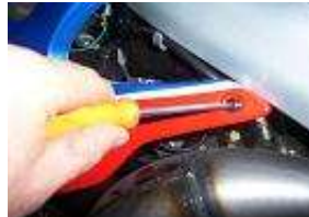
REMOVE THE LOWER MOUNTING BOLTS OF THE FRONT FAIRINGS .