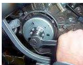
SETUP DERBI ROTOR EXTRACTING TOOL AND REMOVE THE ORIGINAL ROTOR FROM THE CRANKSHAFT WITHOUT FORGETTING THE KEY ON THE KEYSEAT.