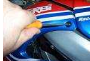
REMOVE THE UPPER MOUNTING BOLTS OF THE FRONT FAIRINGS.