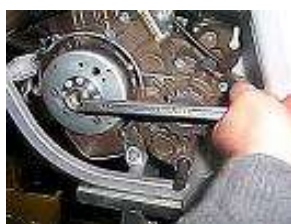
TURN THE ROTOR ON ANTICLOCKWISE POSITION TO MATCH PISTON STOP WITH THE PISTON AND UNTIGHT THE ROTOR NUT USING A 15MM WRENCH.